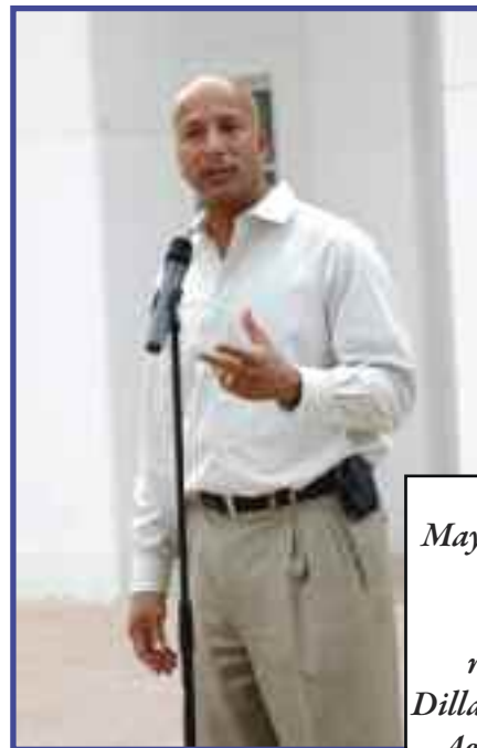
Mayor Ray Nagin addressed Gentilly residents at Dillard's Night Out Against Crime.