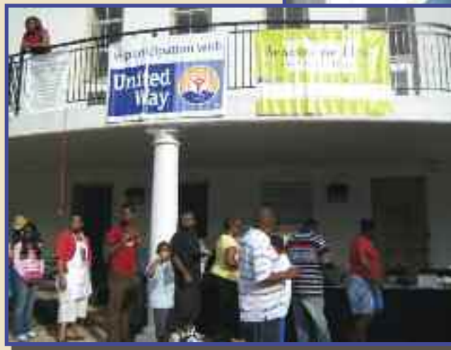
Numerous non-profit organizations participated in the Gentilly Night Out Against Crime.

The Gentilly Clarion is published by the Dillard University Community Development Corporation. Please direct questions, comments and story ideas to 504/816-4205.